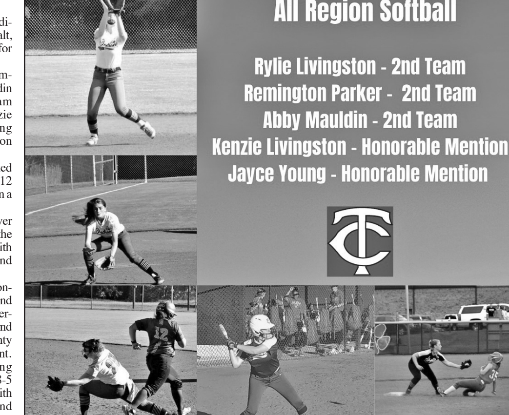
The Lady Indians are well-represented on the 8-A Public All-Region team.

A three-game winning streak pushed their mark to 8-5 but a back-loaded schedule with Social Circle, Commerce and Rabun County, among others, brought the Lady Indians' season to a close at 8-12.