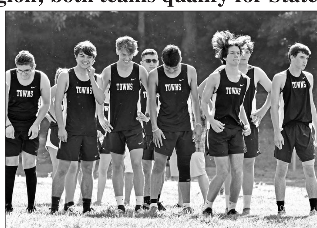
Towns County cross country teams at an early-season meet. Towns will compete in the final State races of the day on Saturday in Carrollton.